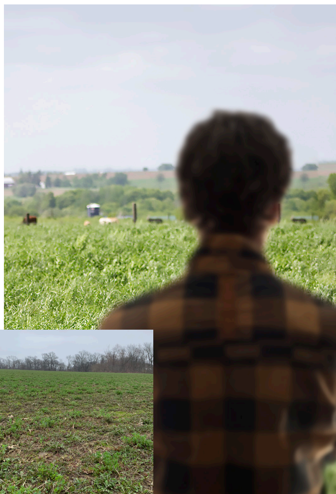
Poor Alfalfa Stand - Illinois ►

Undoubtedly, entire fields could benefit from some level of upgrading. It's crucial for producers to make plans today to ensure they have the seed, labor and equipment ready when our normally tight planting windows present the opportunity to maximize forage yield and quality potential.